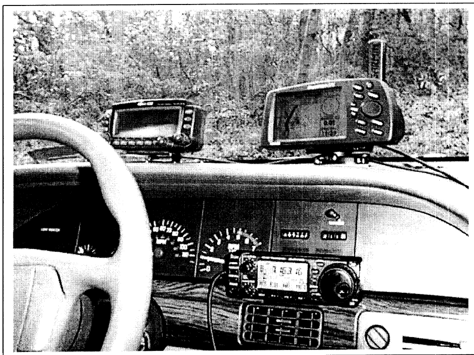
Photo 1. This photo shows W4HFZ's mobile APRS installation. Using the Kenwood APRS mobile data radio, even without a laptop, he has access to hundreds of pages of display information. Now we are adding Tiny Web Pages and whole new databases to these displays.